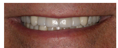
Restores smile and function